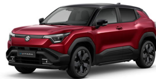
OPULENT RED PEARL METALLIC