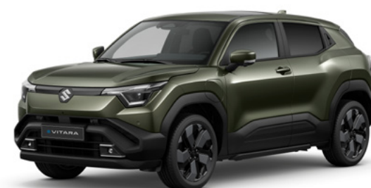
LAND BREEZE GREEN PEARL METALLIC