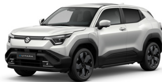
ARCTIC WHITE PEARL