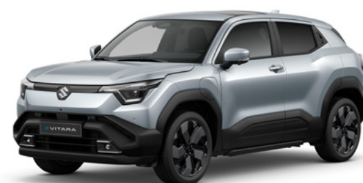
SPLENDID SILVER PEARL METALLIC