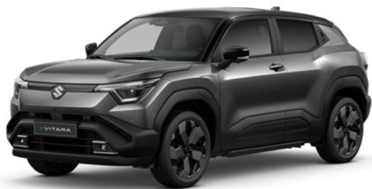
GRANDEUR GREY PEARL METALLIC