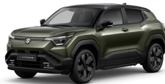
LAND BREEZE GREEN PEARL METALLIC