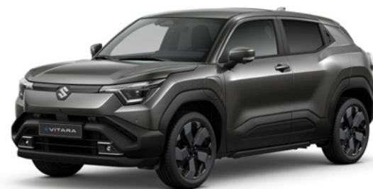
GRANDEUR GREY PEARL METALLIC