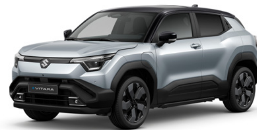
SPLENDID SILVER PEARL METALLIC