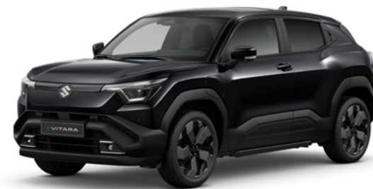
BLUISH BLACK PEARL