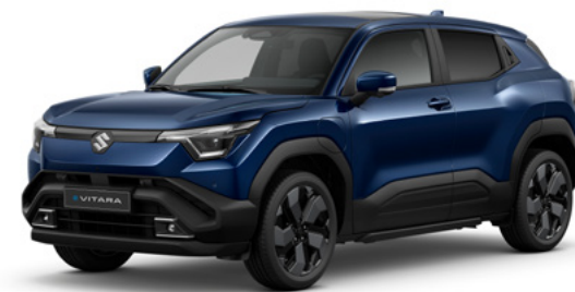
CELESTIAL BLUE PEARL METALLIC