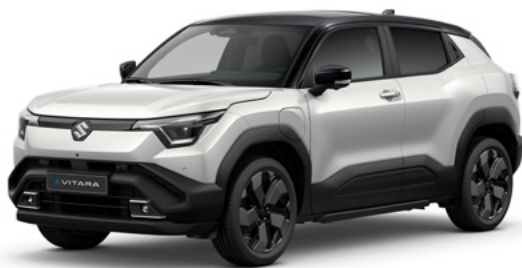
ARCTIC WHITE PEARL