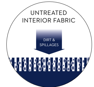
Dirt and spillages are attracted to fabric