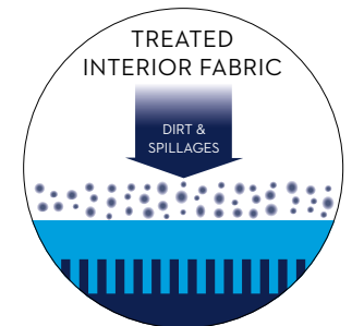
Dirt and spillages are repelled from fabric