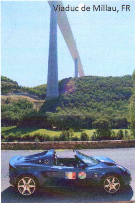
Viaduc de Millau, FR