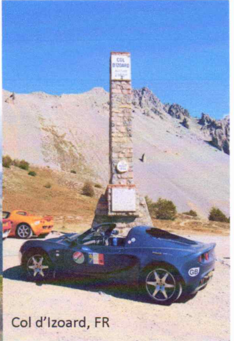
Col d'Izoard, FR