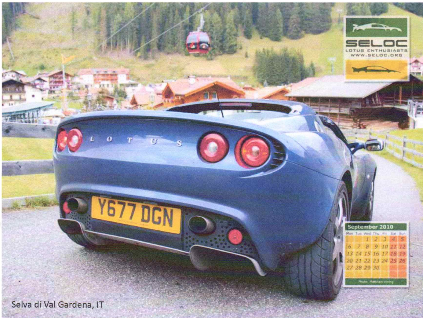
Selva di Val Gardena, IT