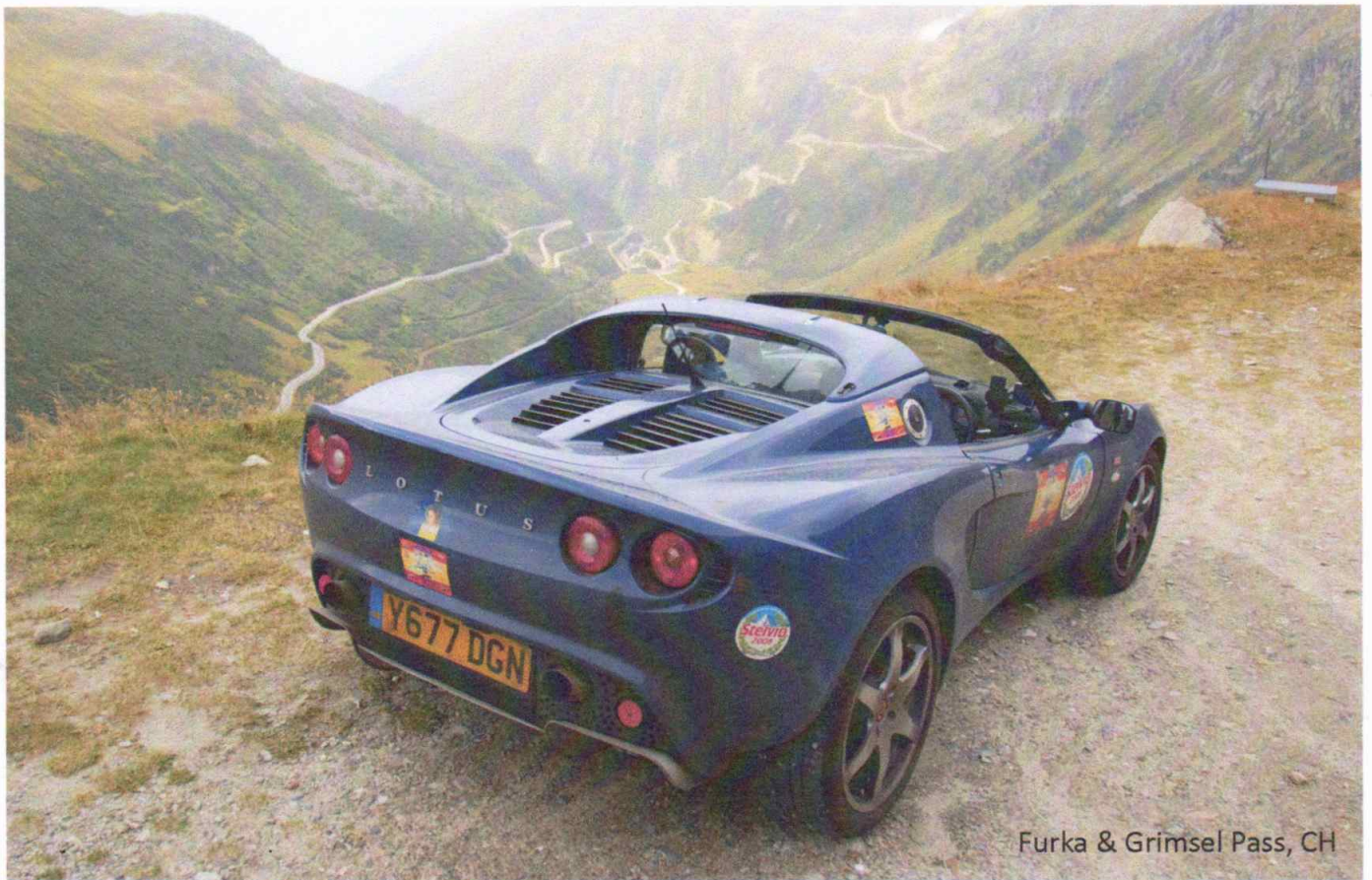
Furka & Grimsel Pass, CH