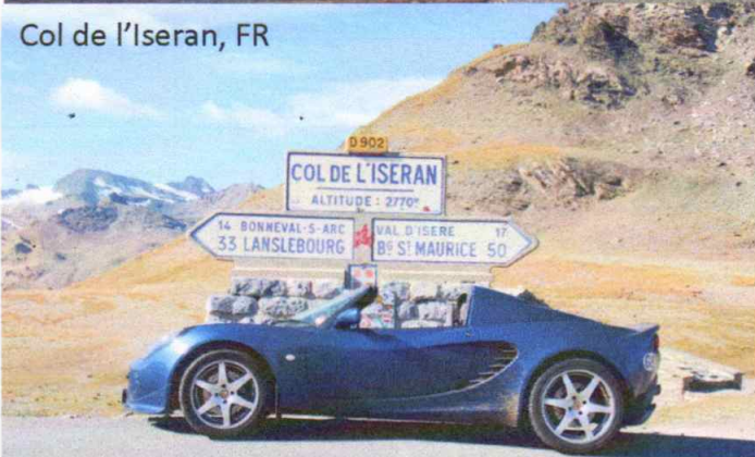
Col de l'Iseran, FR