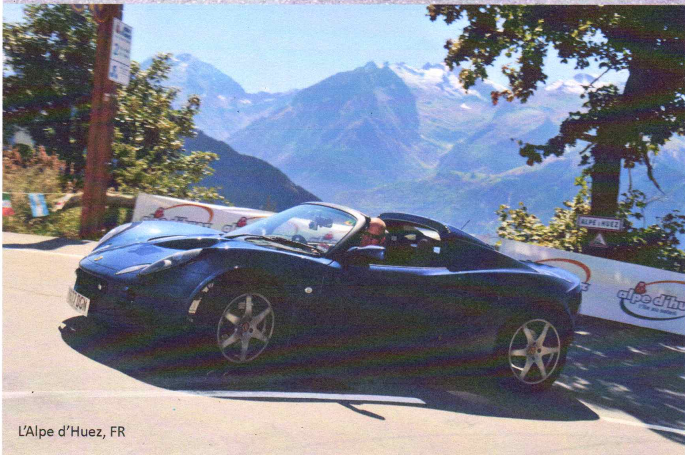
L'Alpe d'Huez, FR