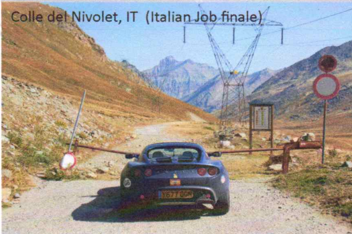
Colle del Nivolet, IT (Italian Job finale)