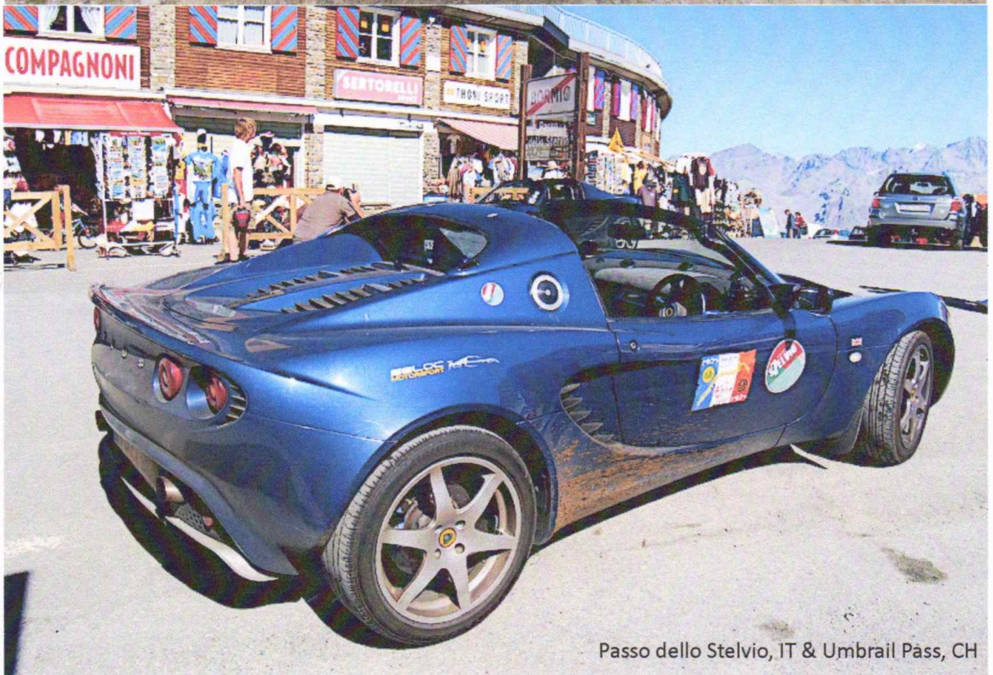
Passo dello Stelvio, IT & Umbrail Pass, CH